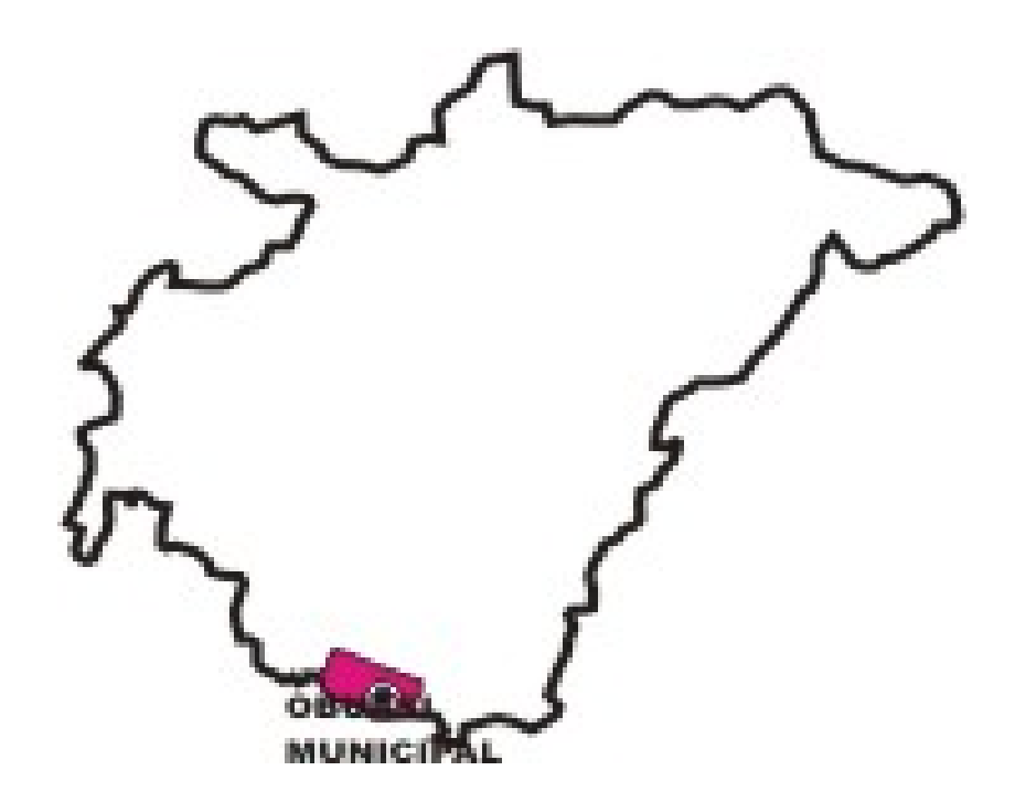
Figure 1: Map of the Ashanti region with an insert of the Obuasi municipality.

The research area is Obuasi municipality, a town which contains one of the ten largest gold mines in Ghana. The town is located in the Southwestern part of the country in the Ashanti region which is Ghana's second capital city. The Obuasi municipality is among 21 districts in the Ashanti region and has an estimated population of 221154 estimated in 2008 by the Ghana Statistical Service (2008). The gold mine in Obuasi has existed since late 1987 (Ayensu, 1997), with different multinational companies taking turns to mine the gold. Currently, the mine is owned by AngloGold Ashanti, a multinational company headquartered in South Africa. Previously the mine was owned by Ashanti Goldfields until 2004 when the AngloGold Company took over the ownership of the mine (AngloGold Ashanti, 2007).